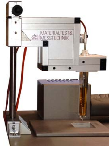
Gear Motor Assembly with Linear Guiding

The installed gear motor for the stroke movement is also Software controlled. The stroke rate is adjustable and can be set from the controller. During the measurement the motor will be automatically switched off after the temperature minimum has been detected.