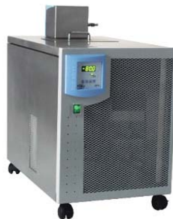
FPT/70 Cooling Thermostat

The Freezing Point Tester FPT 70 is equipped with a powerful Ultra-low cooling thermostat that enables the operator to conduct measurements up to -70°C.