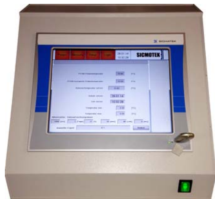
Touch Screen PLC

The operating of the FPT 70 and the FPT 20/SP testers will be done with the installed 12.1" TFT Industrial Touch Screen PLC