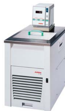
FPT 20/SP Cooling Thermostat

Different to the FPT 70 Tester, the refrigerated Thermostat of the Solidification Point Tester FPT 20/SP has a high temperature range up to 200°C.