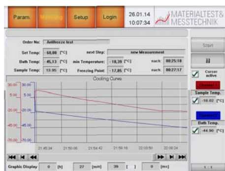
Display actual measurement

The measured values and the actual freezing curve will be shown at the display of the Touch Screen.