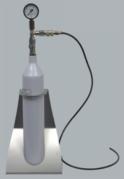
Safety option REF: 60410